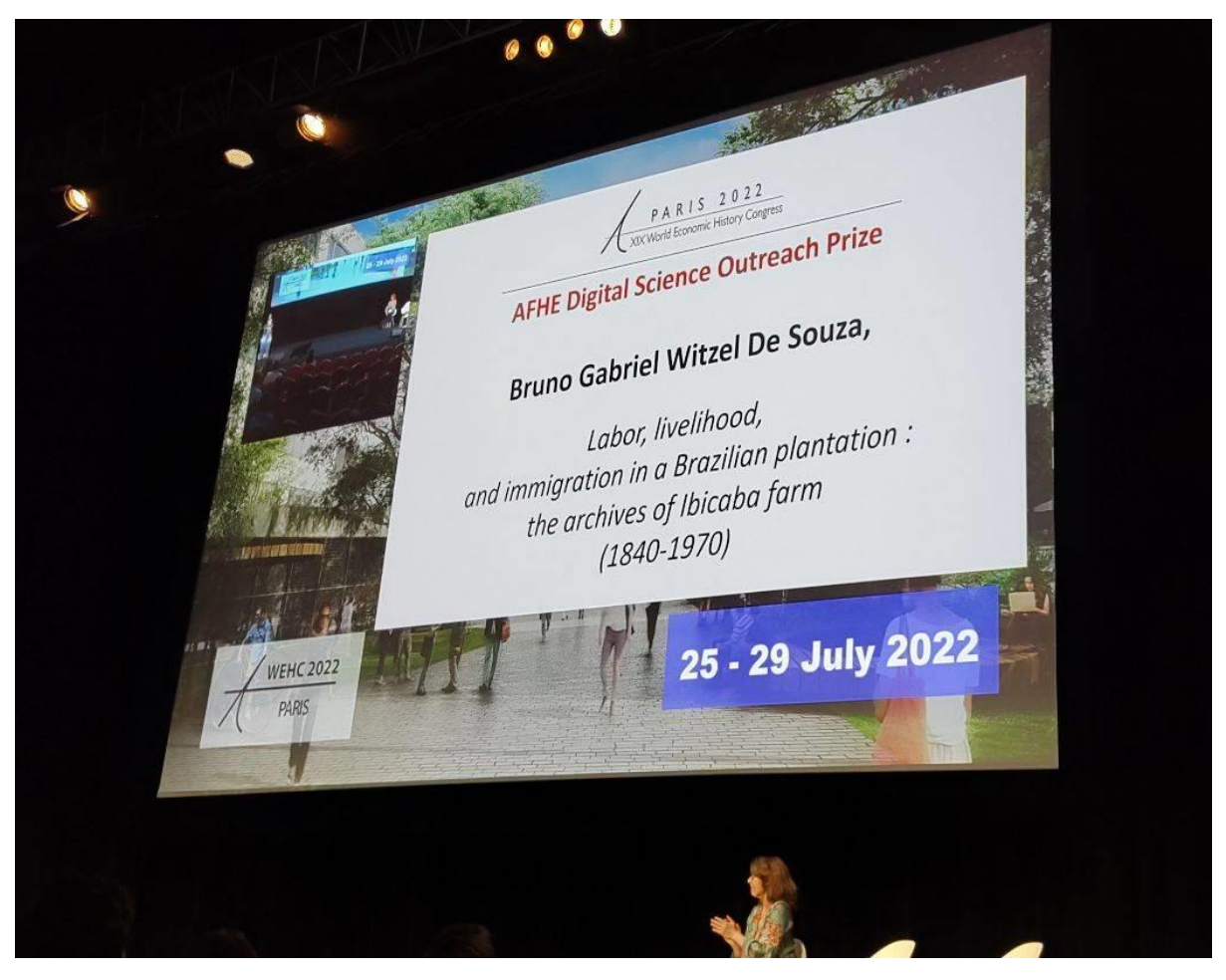
Prize award during the plenary session on July 29, 2022.