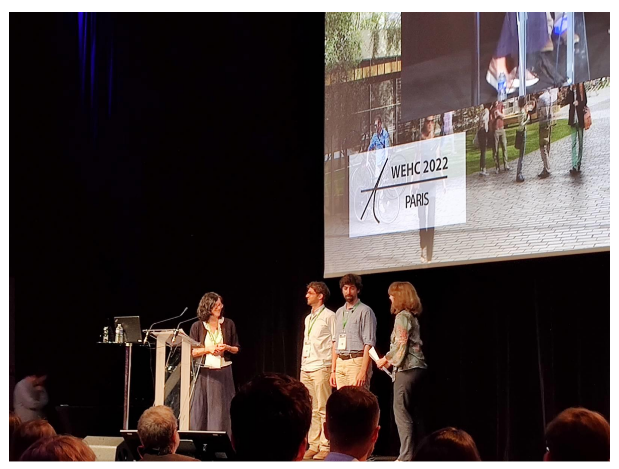
Prize award during the plenary session on July 29, 2022.